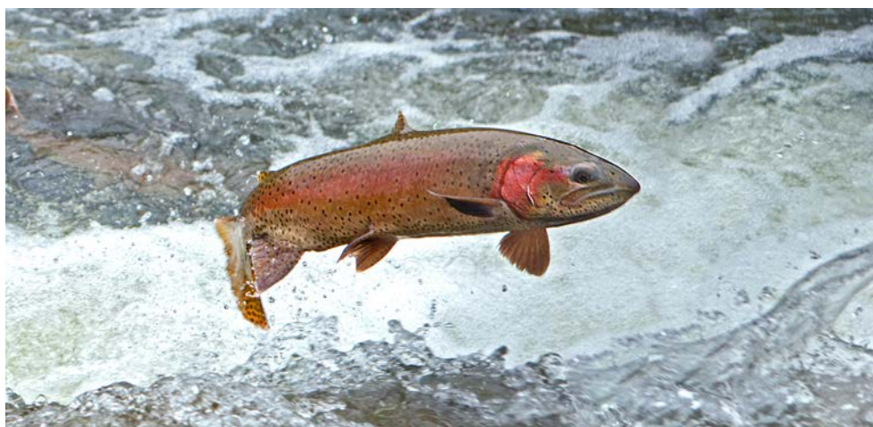
Lahontan Cutthroat Trout

Meanwhile, in the Humboldt and Quinn River watersheds in the eastern Lahontan basin, the fish are mostly stream-dwelling and may grow to only 10 inches. Taxonomist Robert Behnke considered these trout to be a distinct subspecies of cutthroat altogether, Oncorhynchus clarkii humboldtensis .