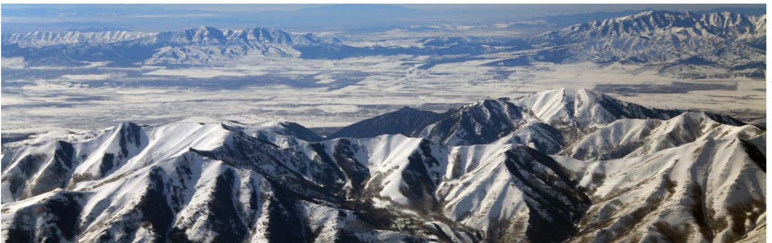
The Oquirrh, Onaqui, and Cedar Mountain ranges in west-central Utah.

But less than two months later, the BLM flip-flopped. Instead of restricting oil and gas development, the BLM announced it would auction off fracking and drilling rights to 14,943 acres of Sheeprocks sage-grouse habitat, including special priority habitat that has been