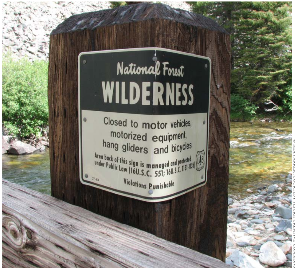
While the Frank Church Wilderness is closed to motorized use by the public, the Idaho Fish and Game sullies wilderness values with their vigilante intrusions.

This unusual remedy was necessary to prevent the agencies from benefitting from the illegal actions—including killing those collared wolves and their packs.