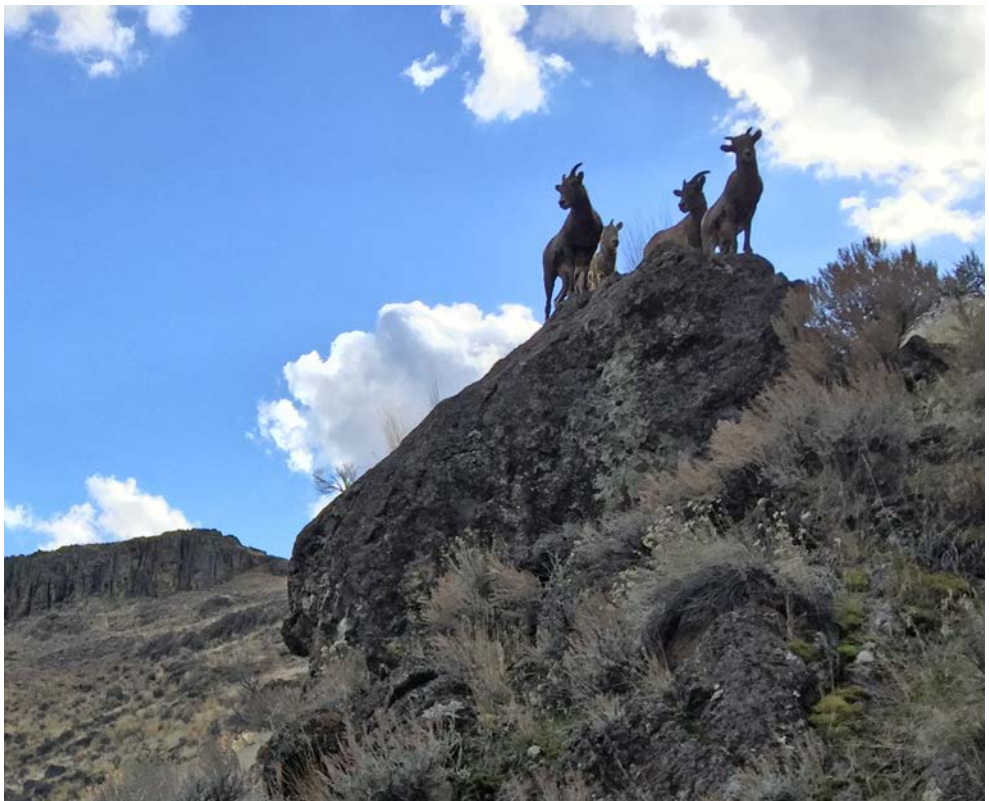
Bighorn sheep in the Oregon Badlands Wilderness Study Area.

The Greenhorn Mountains bighorn herd of Madison County, Montana, stand as another example of the Forest Service's ongoing prioritization of commercial grazing over native wildlife. Here, 69 bighorn sheep were reintroduced to a portion of their native range in the Gravelly/Snowcrest landscape in 2002 and 2003. No transplants have occurred since this time, and the population has struggled to expand. Several domestic sheep allotments between the reintroduced