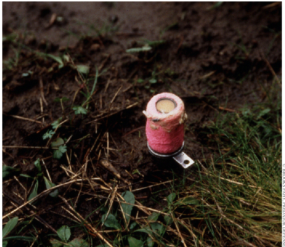
Beware of M-44s such as this when recreating on public lands.

believe that healthy native ecosystems need all of their natural elements, and that targeting predators for eradication is indefensible. We also believe that public lands should be safe for the public to use and we have been working for many years to end Wildlife Services’ wildlife killing programs. Last year, we pressed the Obama Administration to reinstate Richard Nixon’s 1972 Executive Order banning the use of M-44s and Compound 1080, a goal that fell by the wayside after the November election stunned administration officials into inaction. It remains our goal to ban these poisons nationally, permanently. But the recent incident in Pocatello incident galvanized WWP efforts to fight back on behalf of wildlife and public safety, and we quickly organized a team of conservation allies and animal welfare groups to plan a rapid response.