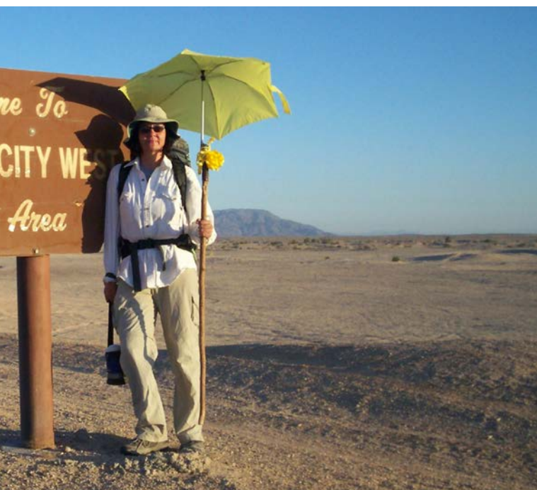
8-mile protest along the path of a proposed transmission line.